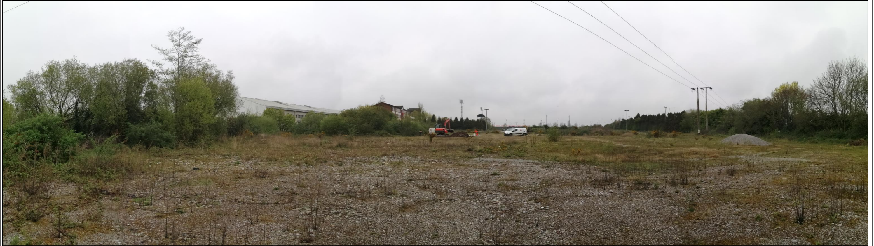
Appendix Figure 13.1.2 The south of the site comprises uneven ground consisting of crushed construction and demolition materials