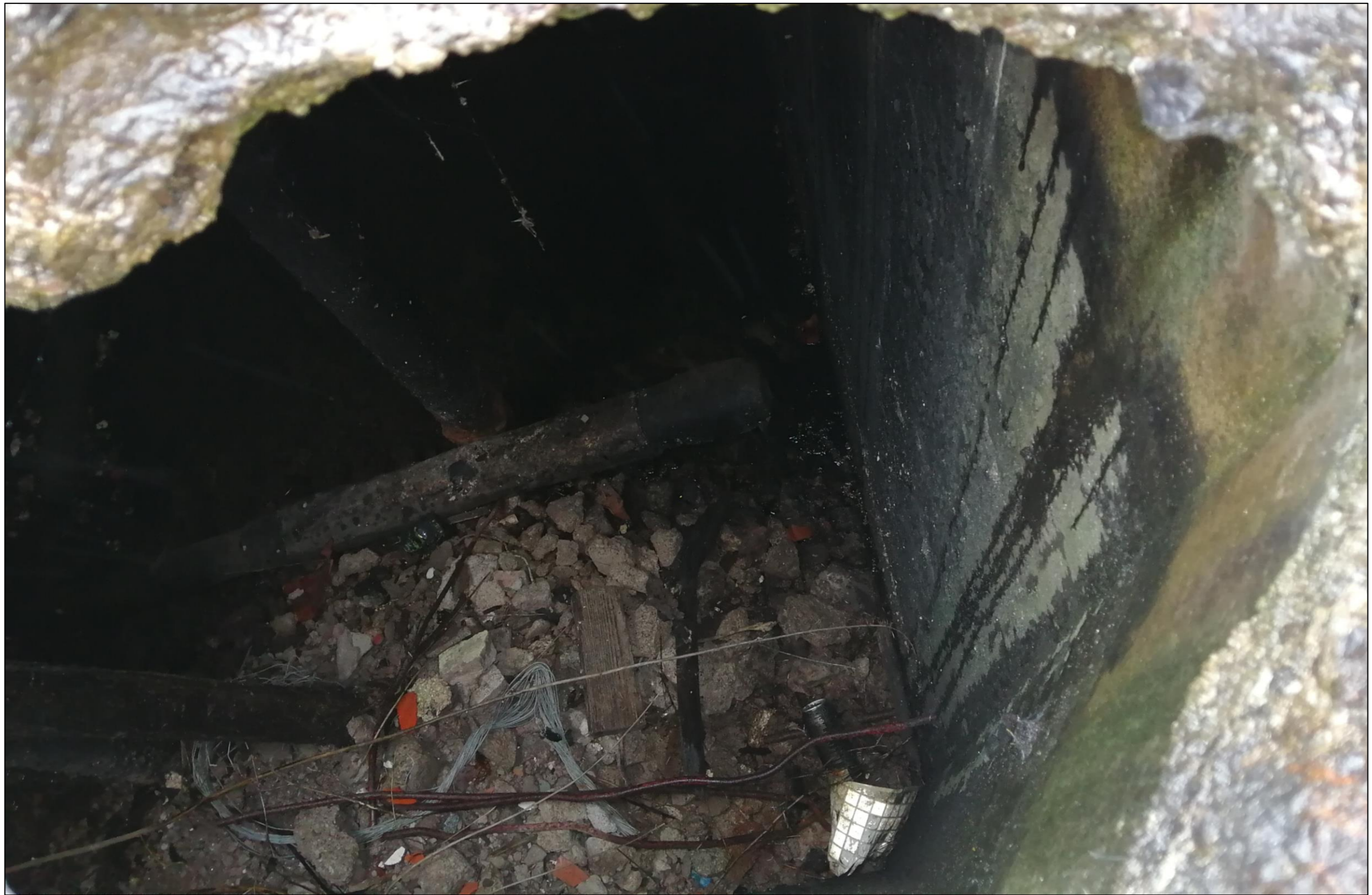
Appendix Figure 13.1.7 In the northwest of the site there was an approximately 2m deep below ground level concrete tank or basement