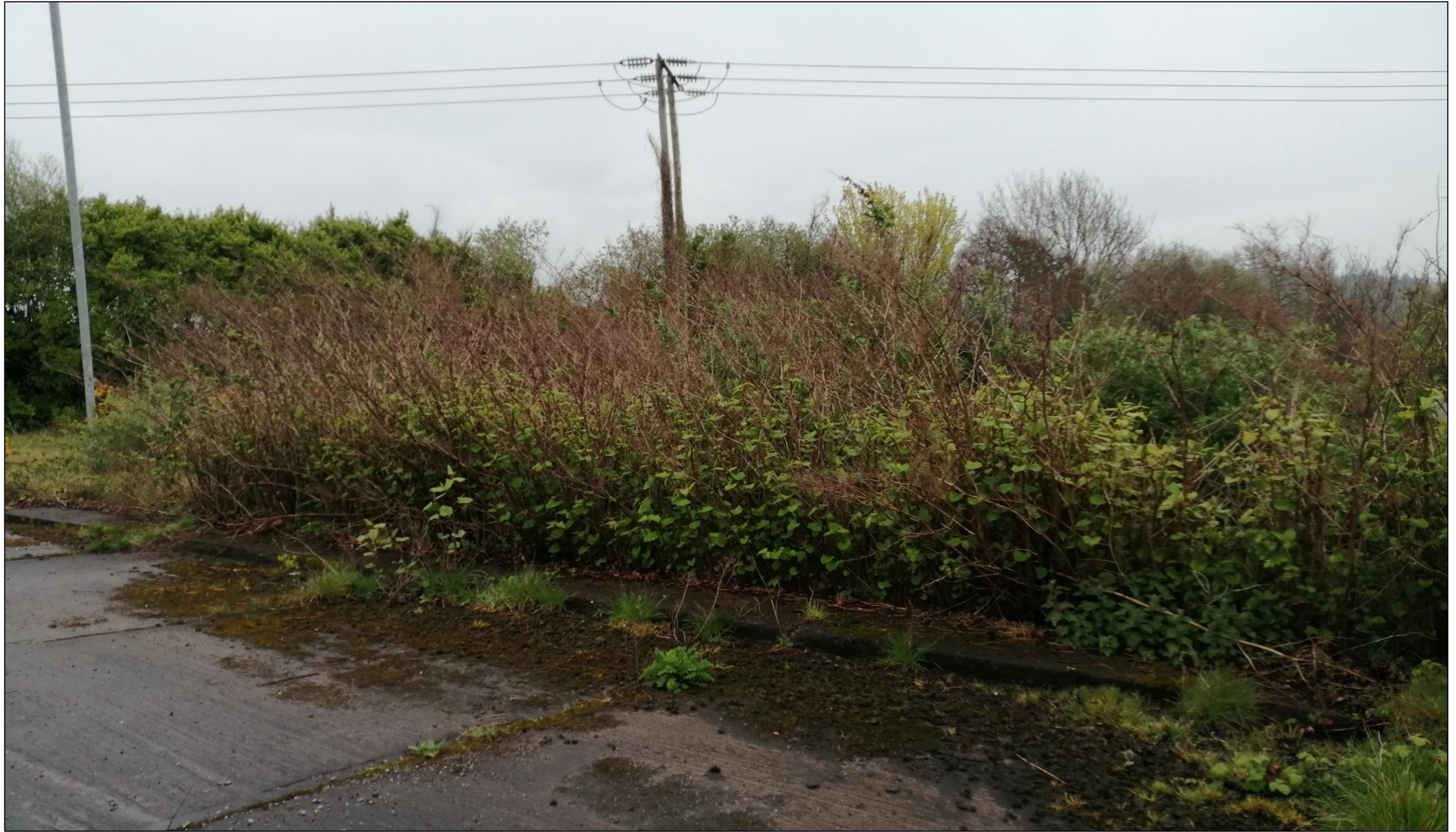
Appendix Figure 13.1.8 Japanese Knotweed noted in several areas of the southern end of the site