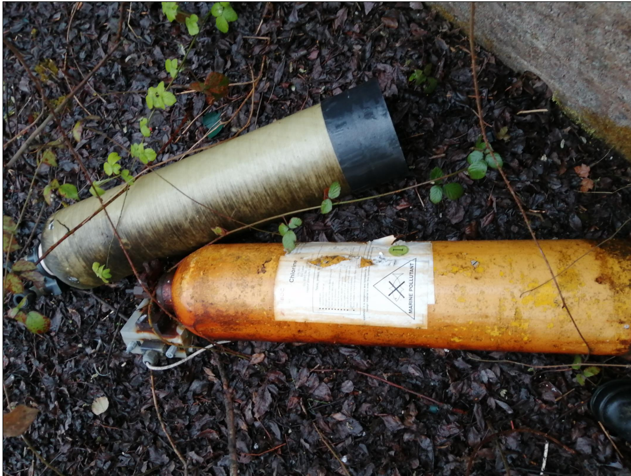
Appendix Figure 13.1.6

In the southwest of the site, close to the location where the well was indicated to be present in a depression, was a potential underground tank and chlorine canisters were noted nearby