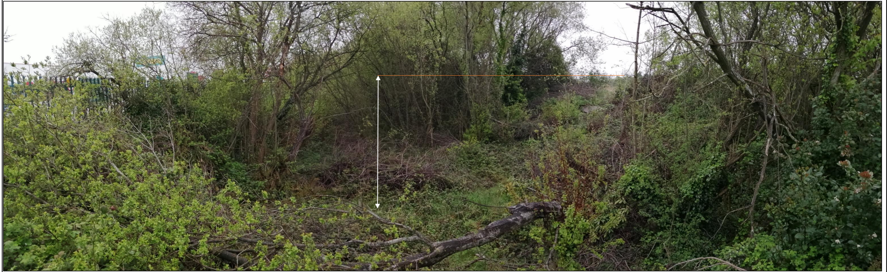
Appendix Figure 13.1.5 Along the southern boundary of the site, in the area of dense vegetation there was a sharp drop off in ground level by approximately 1m to 2m