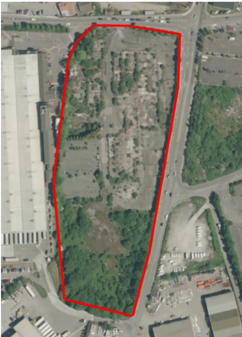
Photo 1: Aerial Location Map. (@Map courtesy of Forest Service - IFORIS MAPPING SYSTEM).

2.1 The study area are those lands outlined on the Aerial Location Map - Photo 1 below.