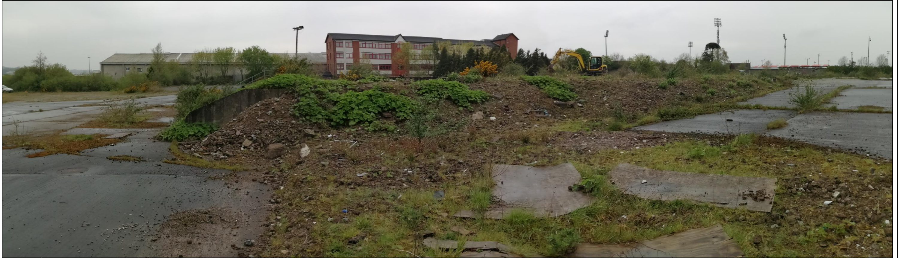
Appendix Figure 13.1.4 The centre of the site where the former factory was raised above the surrounding ground level