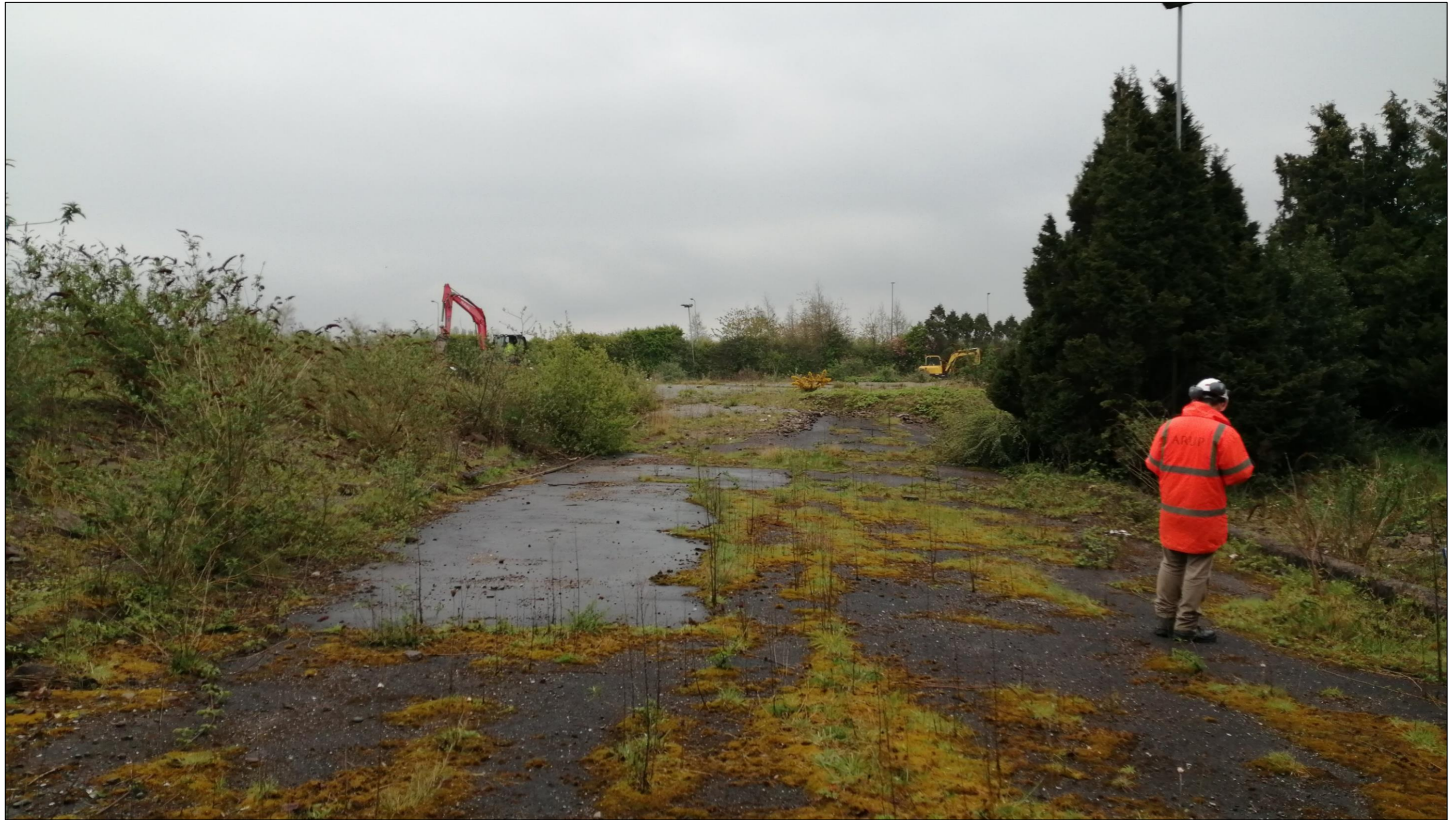
Appendix Figure 13.1.3 Northwest of the site where there was an area of lowered ground